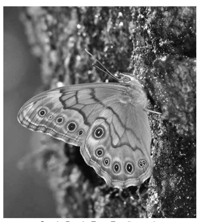
Creole Pearly-Eye, Enodia creola , BCSA, 1/IV/2007 (P. Schappert)