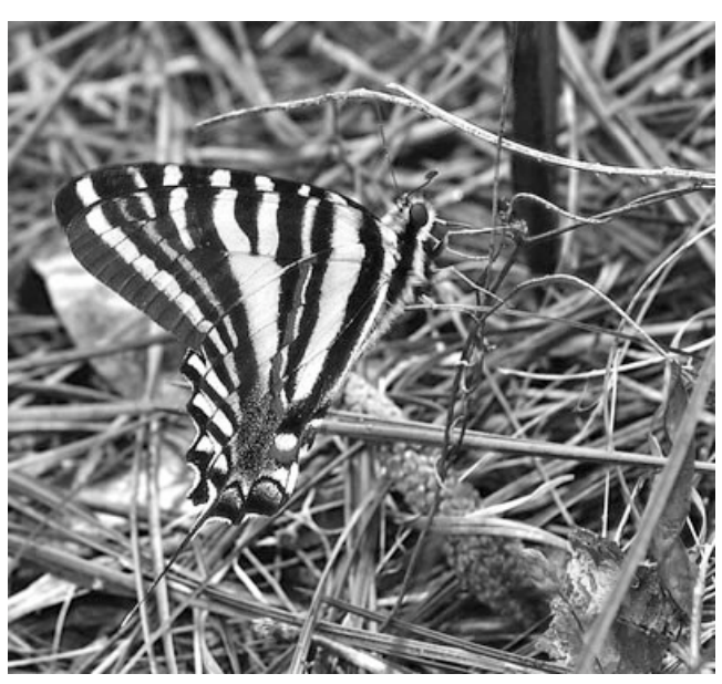
Zebra Swallowtail, Papilio marcellus , Larsen Sandyland Sanctuary, 1/IV/2007

After leaving the Larsen Sandyland, why not visit the Sundew or better still, the Pitcher Plant Trail of Big Thicket National Preserve? Return to US 69 and follow it north to access both of these sites (Ro's site 38, areas C and D). I fully expect to encounter Georgia/Halicta Satyr (Neonympha areolata/halicta) at the Pitcher Plant Trail in the coming month. Note that none of these sites has an entrance fee! What more could a butterfly watcher ask for?