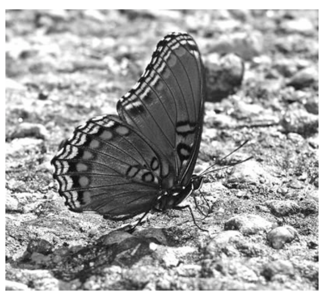
Red Spotted Purple, Limenitis arthemis astyanax, BCSA, 1/IV/2007

Membership is now paid per calendar year with quarterly prorating after the first quarter. The cost is $20 per household. If your membership has expired please don't forget to renew.