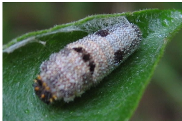
Goatweed leafwing larva on croton